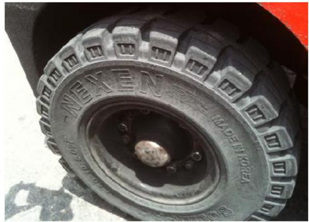
CoCa-Cola Warehouse in Philippines