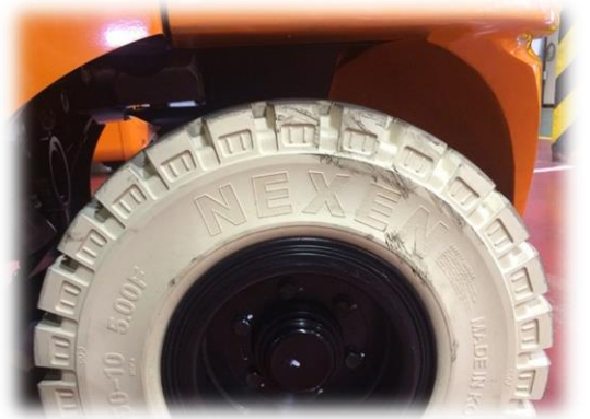
Non-Marking Tire (IVORY)