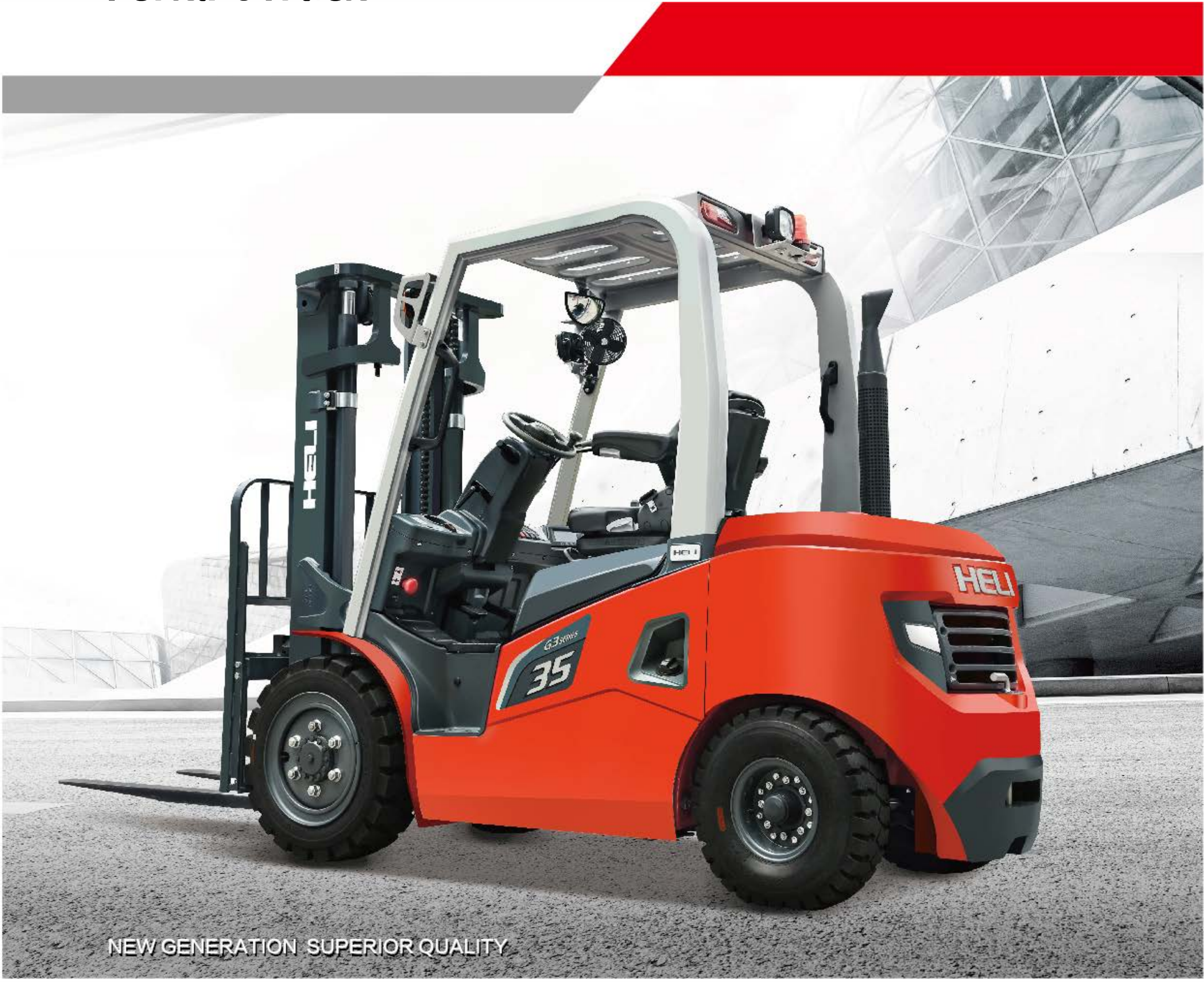
NEW GENERATION SUPERIOR QUALITY