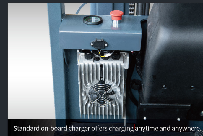
Standard on-board charger offers charging anytime and anywhere.