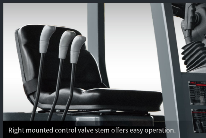
Right mounted control valve stem offers easy operation.