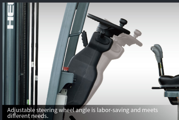
Adjustable steering wheel angle is labor-saving and meets different needs.