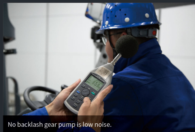
No backlash gear pump is low noise.